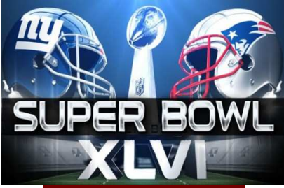
Super Bowl MVP Eli Manning