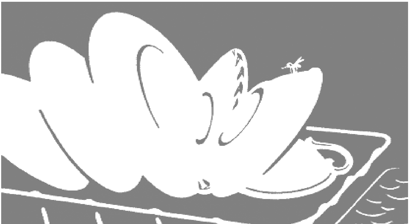
An Opera House in every home , by Eric Thake

Writing and Communication: We will respond to several of the major units or works with a formal essay assignment with an emphasis on the essay's content, organization, style, and mechanics. Students will learn to use the stages of the writing process from brainstorming to outlining, drafting and making final revisions.