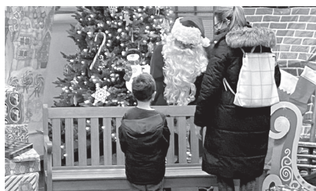
Holiday celebrations at Franklin and Lindbergh Elementary (December 2021)