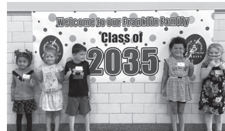
Welcoming the Franklin ES Class of 2035