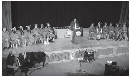
Big Picture 2022 Graduation