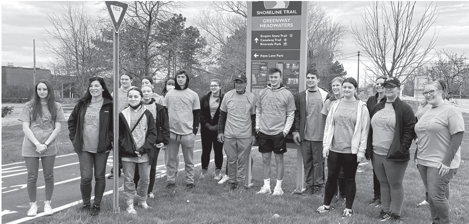
Earth Day clean-up at the Niagara River Greenway Shoreline Trail (April 2021)