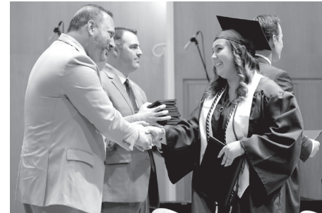
Kenmore West 2022 Graduation