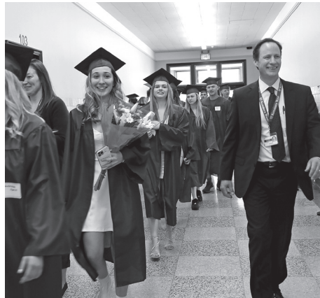
East and West graduates proudly parade through the elementary schools for their Senior Walk