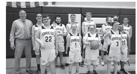
The Kenmore East and Kenmore West Unified Basketball Teams return for their second season (May 2021)