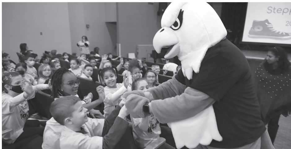
Holmes Elementary students welcomed the school's new mascot in January 2022