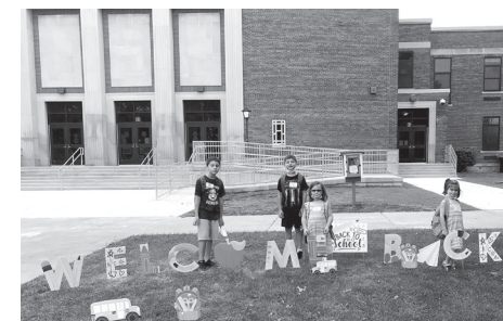
Students arrive for the first day of school at Hoover Elementary (September 2021)