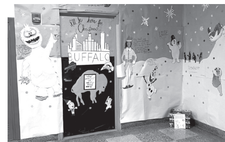
Door decorating at Franklin Middle School (December 2021)