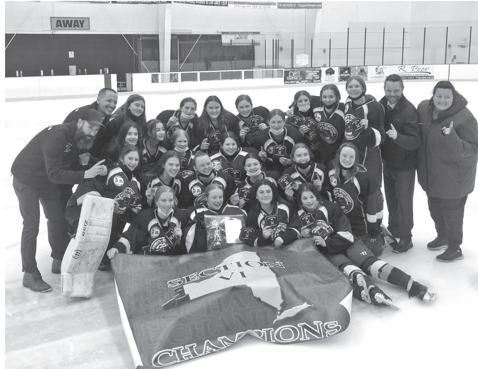
Kenmore/Grand Island Girls Hockey wins the Section VI Championship (February 2022)