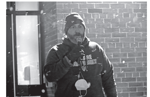
Supporters attend the Annual Jerry Starr Ken-Ton Schools' SleepOut to help those in need in our community