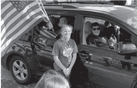
Edison Elementary "Sweet Treat Drive-Thru" for Veterans Day (November 2021)