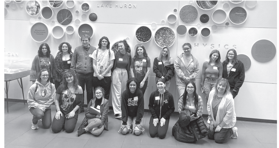
The Kenmore East Future Teachers Club at Buffalo State College (April 2021)