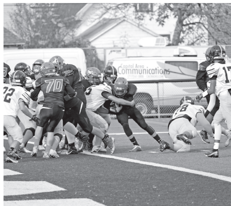
Kenmore East vs. Kenmore West Varsity Football (October 2021)