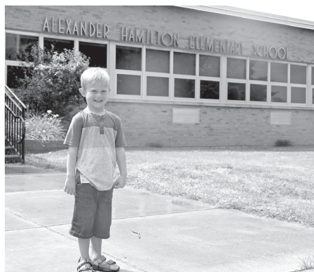
The new full-day Universal Pre-Kindergarten Program in partnership with the Ken-Ton YMCA kicks off at the newly reopened Hamilton Elementary Building (September 2021)