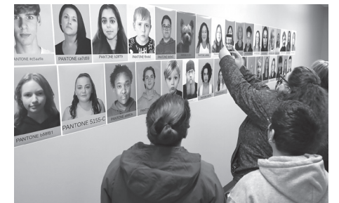
"Love the Skin You're In," a collaboration by multiple art teachers and their students, debuts at the Family Support Center (November 2021)