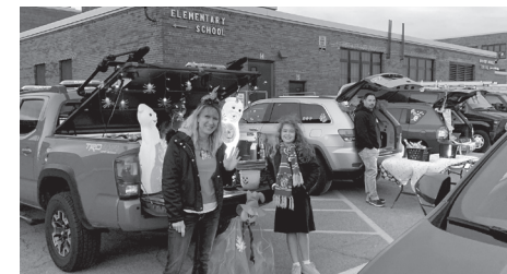
Trunk-or-Treat at Hoover Elementary School (October 2021)