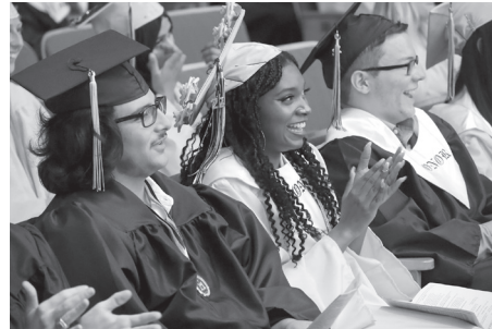
Kenmore East 2022 Graduation