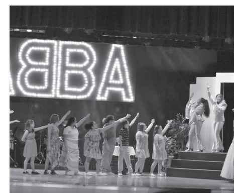
Scenes from the Kenmore West and Kenmore East musicals (March 2022)